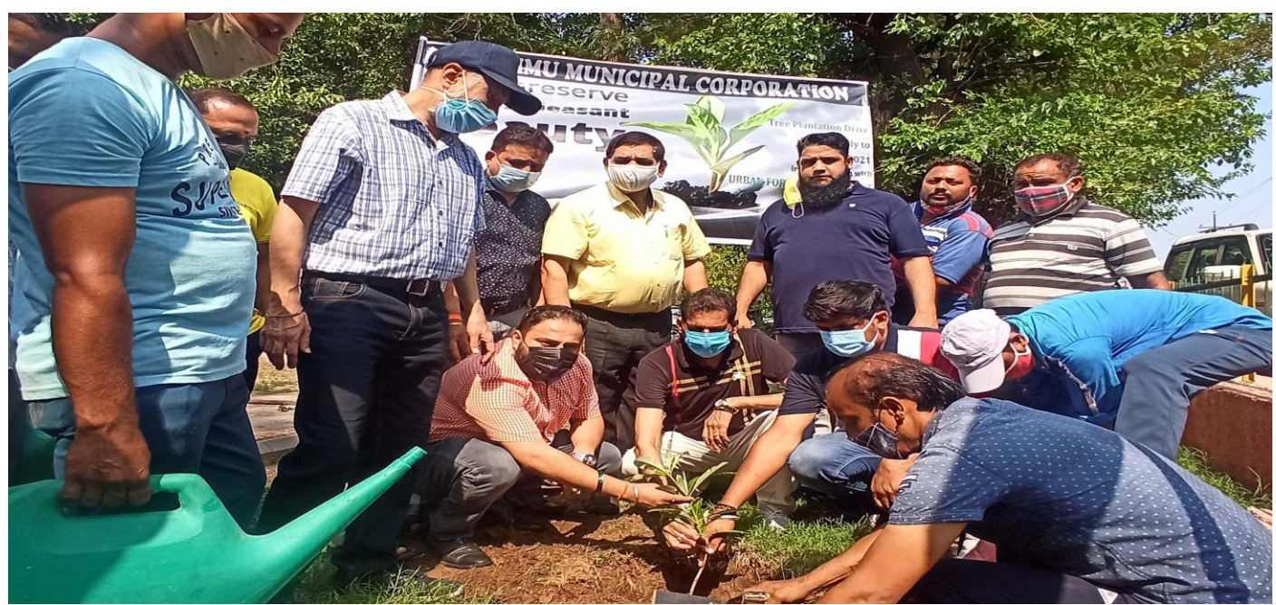
15<sup>th</sup> July 2021