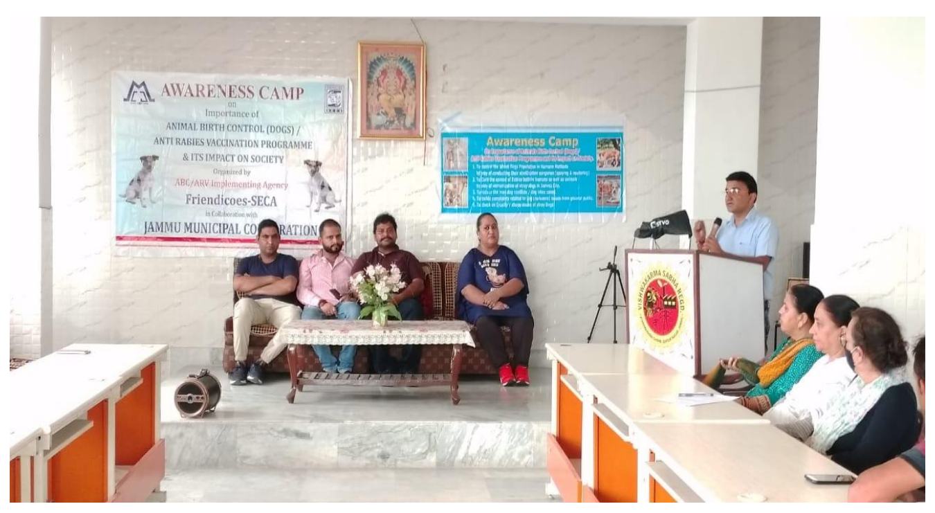
29^{th} August 2022