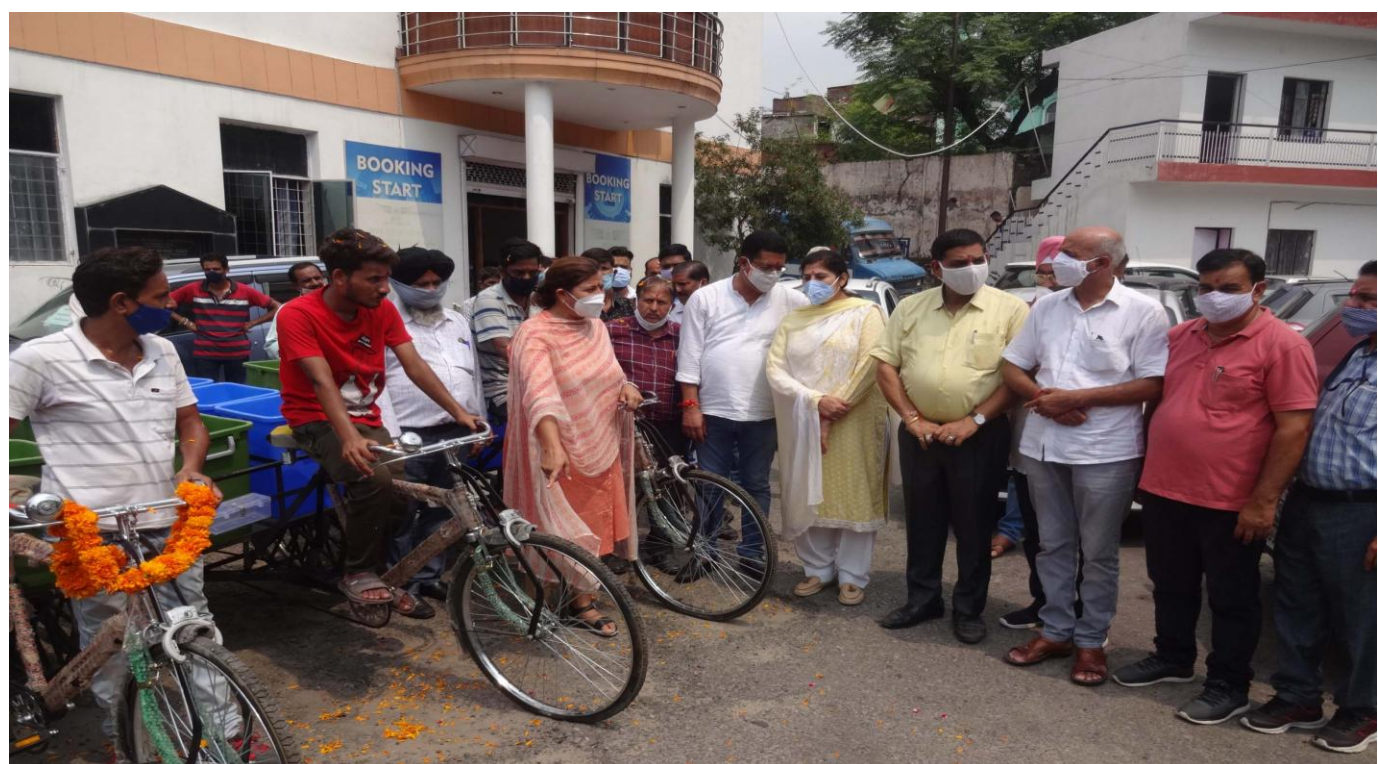
26^{th} August 2021