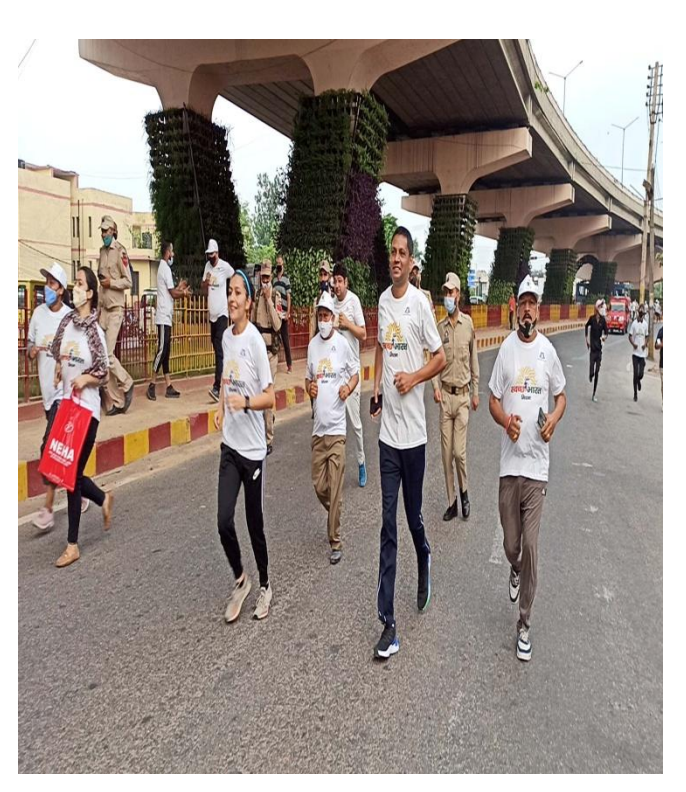
12<sup>th</sup> August 2021