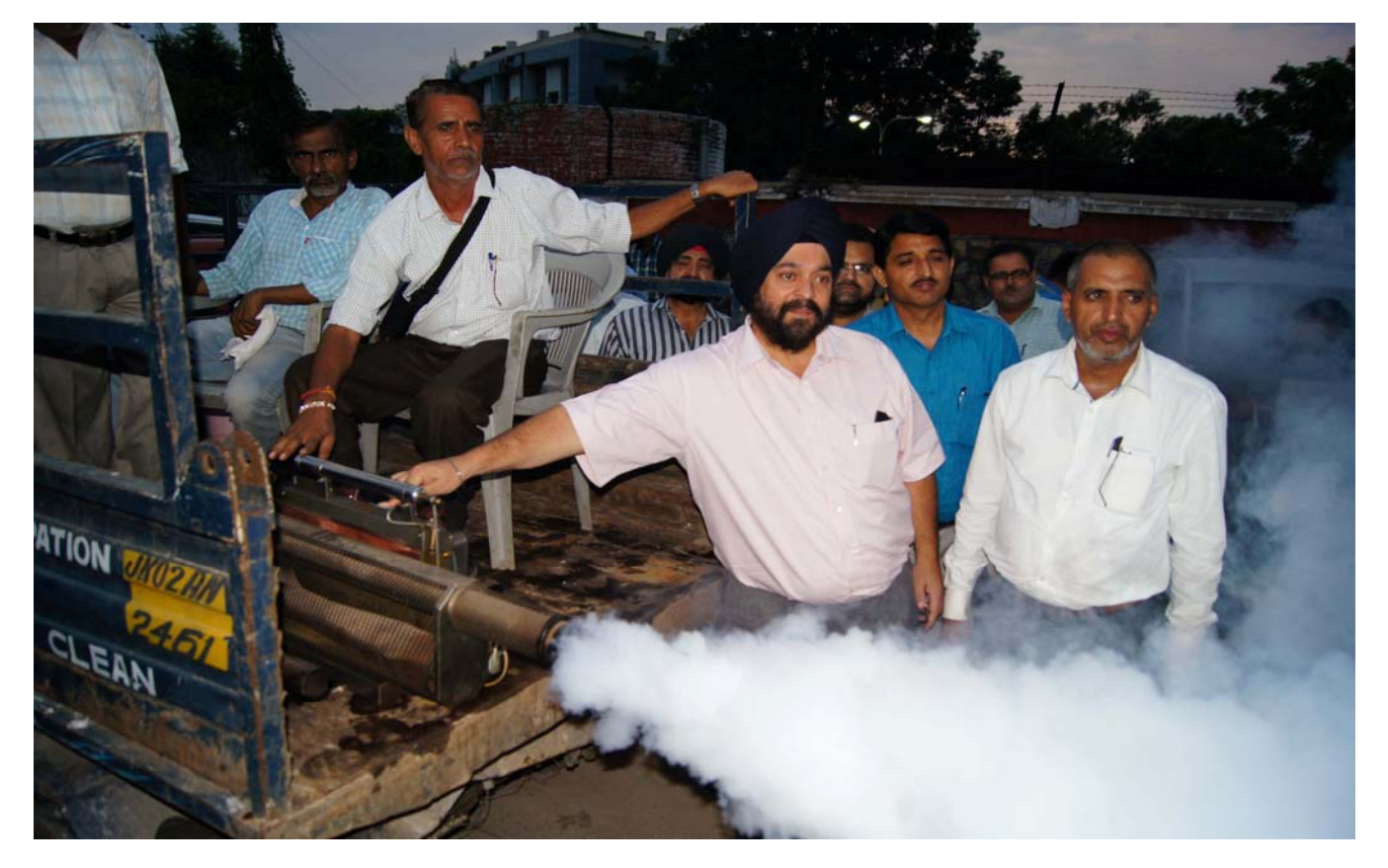
1 Sep. 2016