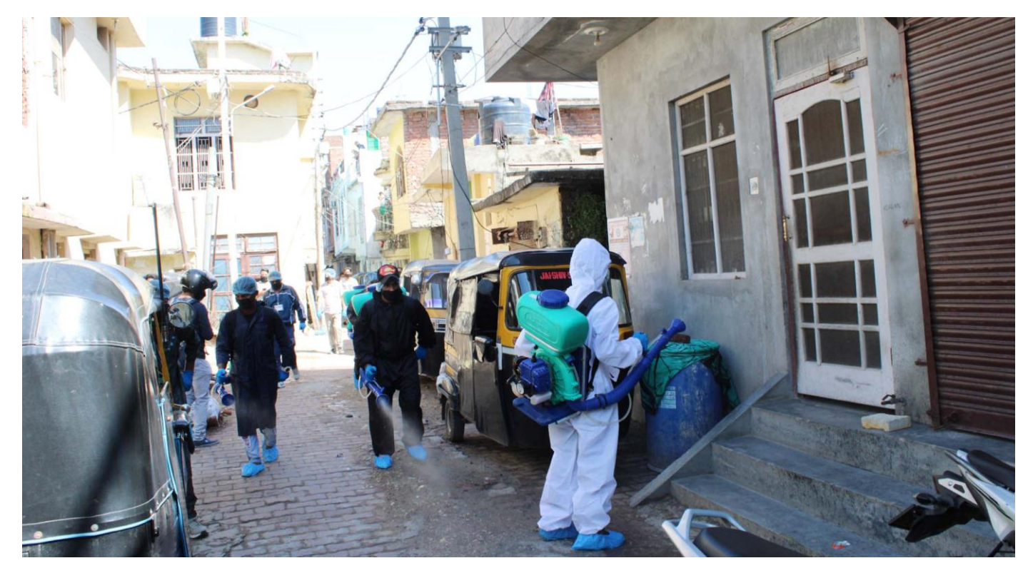
18<sup>th</sup> April 2020