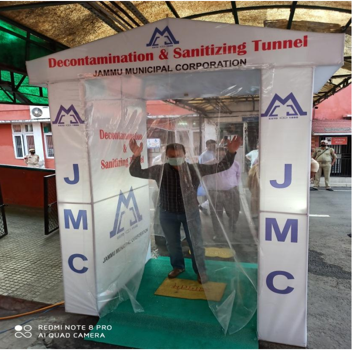
8<sup>th</sup> April 2020