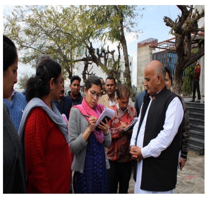
12th March 2020