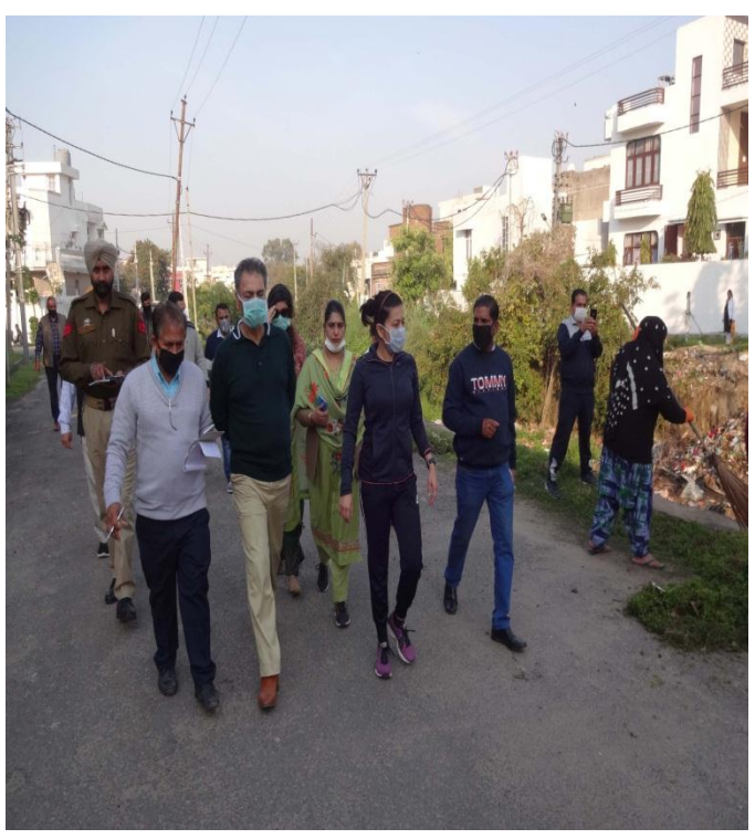
19th March 2020